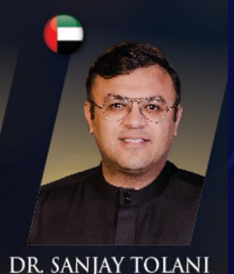
Becoming a True Financial Advisor