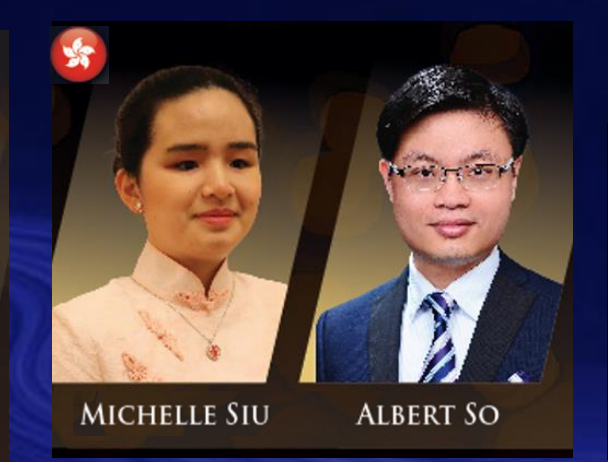
More than a Dream

The role and function of Insurance in Family Offices