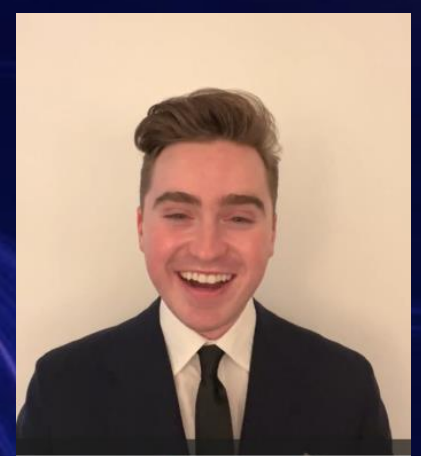
× 14 % ( ) % × ∞