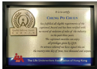
金屬證書 Metal Certificate