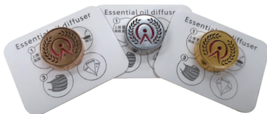
香薰扣 (口罩或衣領用) Aroma Pin (For Mask or Collar Use)