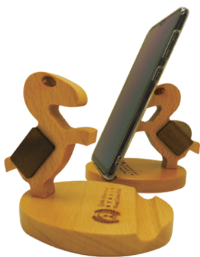
「馬到功成」刻名電話座 Mobile Stand with Logo