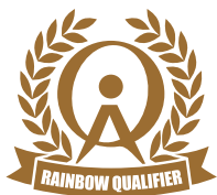
QAA / QMA / QLA Rainbow Qualifier 顧問 / 經理 / 領袖 - 彩虹獎