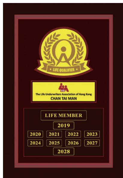
終身獎證書 Life Certificate

In order to achieve the objectives of supporting the development of the insurance industry and uplifting practitioners' professionalism, the LUAHK established the Quality Advisor Award (QAA) and Quality Manager Award (QMA) in 2009, emphasizing the life-long commitment to "quality service, professionalism and integrity". The key objective of the Awards is to demonstrate the trustworthy and professional aspects of the awarded insurance advisors to the public, and serves as a "Q-Mark" brand accreditation to their service quality.