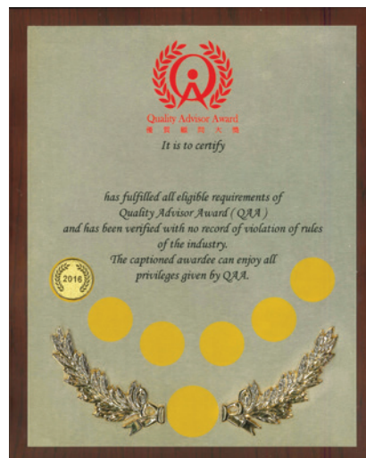
木盾證書 Wooden Certificate