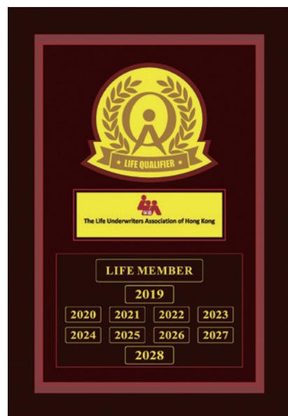
終身獎證書 Life Certificate