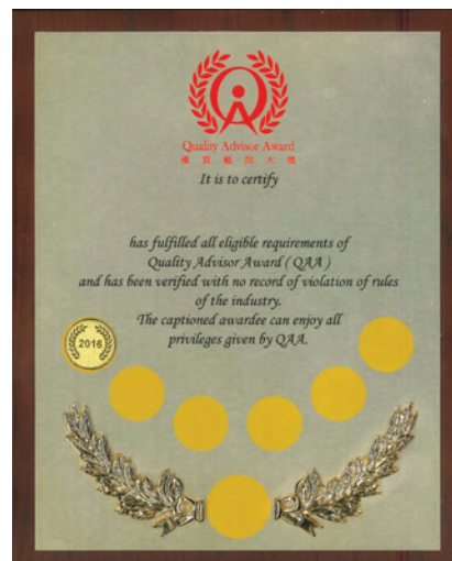
木盾證書 Wooden Certificate