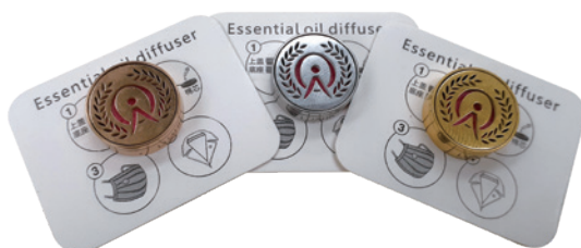
香薰扣 (口罩或衣領用) Aroma Pin (For Mask or Collar Use)