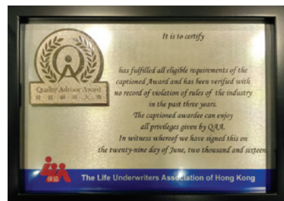
金屬證書 Metal Certificate