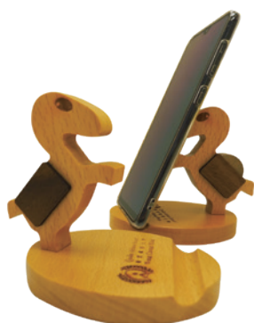
「馬到功成」刻名電話座 Mobile Stand with Logo